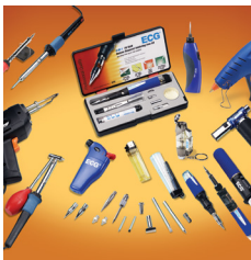
• Butane Torches